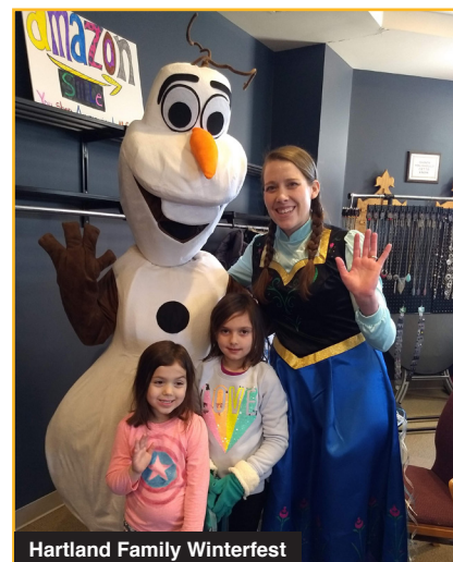
Hartland Family Winterfest