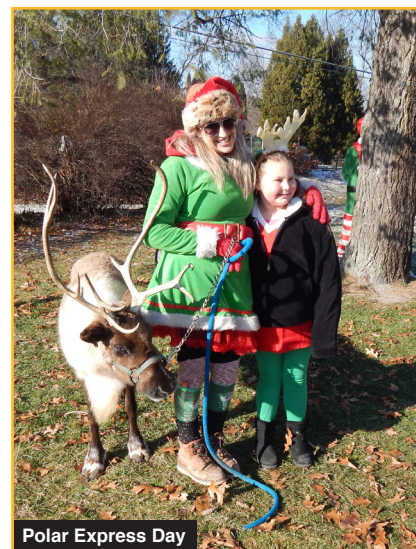
Polar Express Day