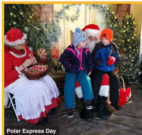
Polar Express Day

If you need an accommodation to attend an event, please call 810-632-5200.