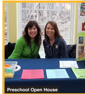
Preschool Open House

Do you love Paw Patrol? Then join us for Paw Patrol-themed crafts, games, snacks and more! For ages 2 and up.