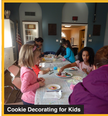
Cookie Decorating for Kids

'Tis the season for cookies! We'll provide the cookies, frosting, decorations and fun--you provide the creativity! For grades K through 4.