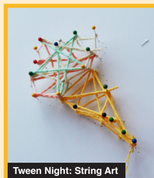
Tween Night: String Art