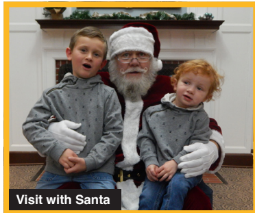
Visit with Santa

Bring your camera, listen to a story and meet a special man. Please register every family member attending, including parents, grandparents and siblings.