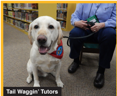
Tail Waggin' Tutors

Develop a love of reading with a caring and patient canine friend! Each child will have 10 minutes to read to a certified therapy dog.