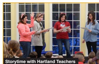
Storytime with Hartland Teachers