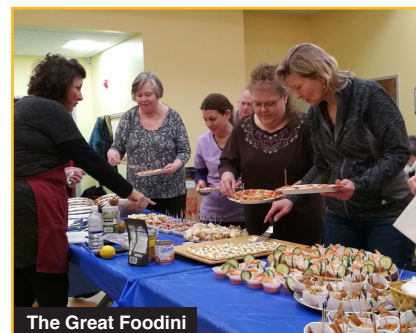
The Great Foodini