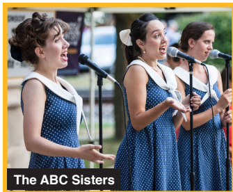
The ABC Sisters