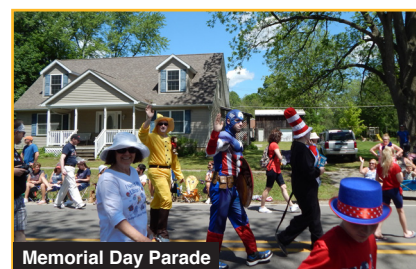
Memorial Day Parade