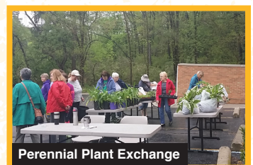
Perennial Plant Exchange

Bring perennials you want to exchange. Label them with name, color, height and sun- or shade-loving. Labels available or make your own. Master gardener on hand to answer questions. Held rain or shine in library parking lot. Co-sponsored with the Hartland Home & Garden Club. Drop-in.