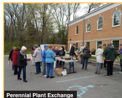
Perennial Plant Exchange

Sunday: Free Day! All remaining items from the Friends Book Sale in the Community Room are available free from 12 to 1 pm, Sunday only. Bring your own boxes and bags, please.